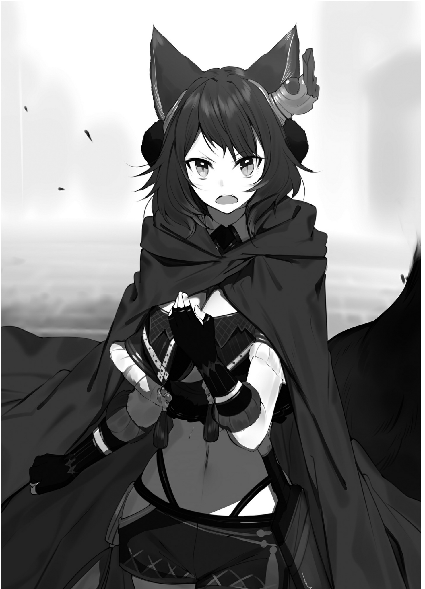
Her steadfast gaze reminded me a little bit of Amelia's.